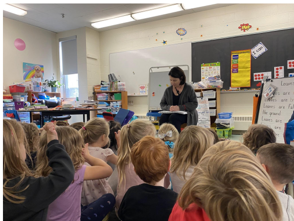
Primary phonics lesson.