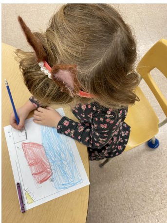
Primary writing in action!