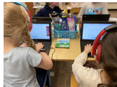
First time logging in to class chromebooks in ½ Brennan/Pope