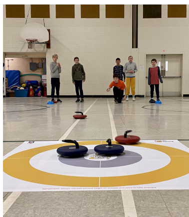
Rocks and Rings Curling in Phys. Ed. classes