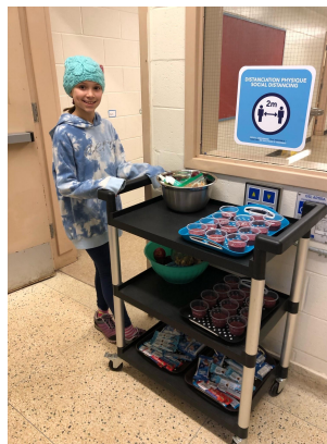
Breakfast Program Volunteers!