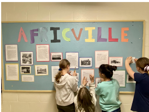
For three weeks students in 6 Ryan shared their learning during African Heritage Month and had daily questions for our students.