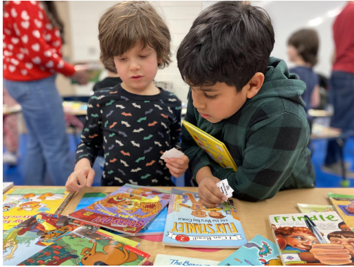
Students in grades 1 & 2 enjoy the Love of Reading Book Swap