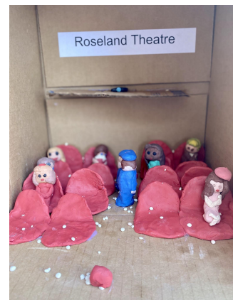
One of the many amazing projects completed by 2 students in 5/6 Jodrey for the African Nova Scotian History Challenge.