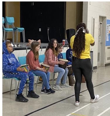
Maritime Center for African Dance!