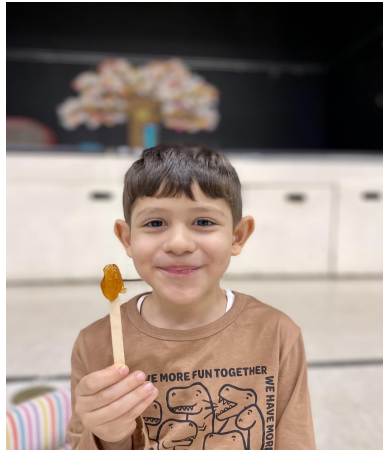
Maples Syrup on Snow!