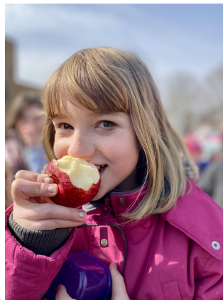
Nutrition Month: The Big Crunch!